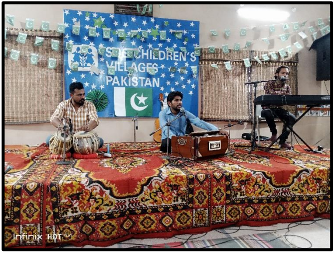
Defense Day Celebration: